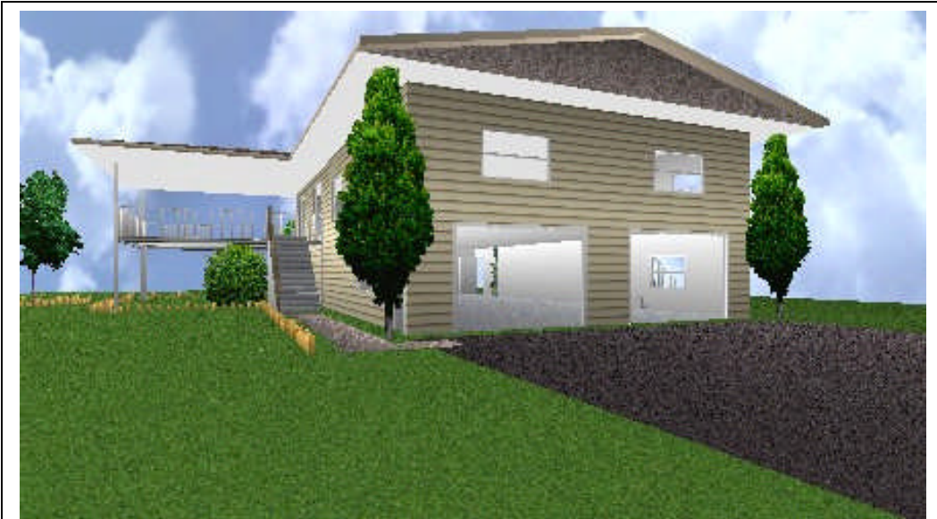
Garage end view

This proposal is valid for 10 business days from the date presented unless signed contracts are in place.